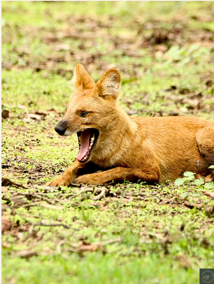
WILD DOG (DHOLE)

Transfer to airport in time to board your flight back home.