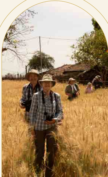
GUESTS IN FARM

Transfer to airport in time to board your flight back home.