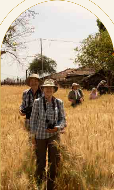
GUESTS IN FARM

Transfer to airport in time to board your flight back home.