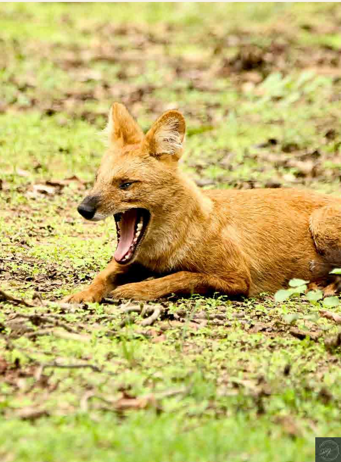
WILD DOG (DHOLE)

Transfer to airport in time to board your flight back home.